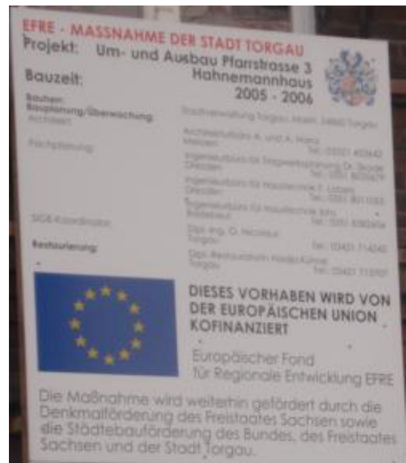
Figure 7: Restoration project of Hahnemann's House

Hahnemann practiced there as a physician, and it was there that he wrote several of those works which had a lasting impact right down to the present day.