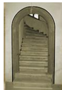
Figure 4: Staircase

Through the current restoration some very beautiful details lasting down through several centuries are being once again brought to light. Even during Hahnemann's time the spiral staircase, made from quarry sandstone, was described as “in bad shape and almost unusable.” As the tower housing the staircase had bent over 350 years ago, it needed to be fixed with concrete injections during the restoration in 2007 (figure 4).