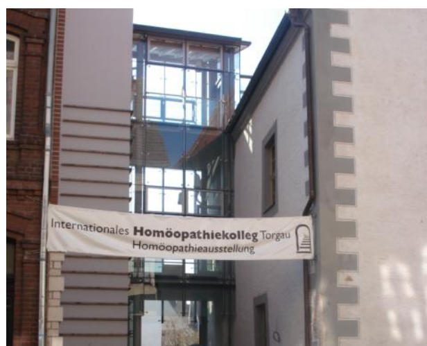
Figure 9: International College of Homeopathy at Hahnemann’s House in Torgau

Keeping with the spirit of Hahnemann, the International College of Homeopathy at Hahnemann’s House in Torgau was founded in 2003 (Figure 9). It is concerned with the training and continual education of homeopaths, strictly according to the method of Hahnemann and his genuine followers. It is also devoted to restoring and utilizing Hahnemann’s House as a listed historical building, to serve once again as a centre for homeopathic therapy, teaching and research.