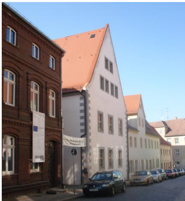
Figure 8: Hahnemann's House (front)

European Community, the Federal Government of Germany and the Saxon State to reconstruct and restore the old part of the building as well as to attach a modern part containing a lift and toilets for visitors (figure 8).