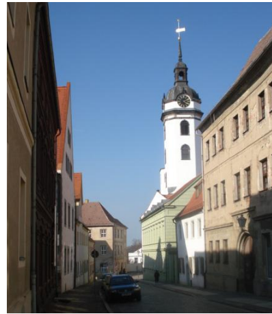
Figure 2: Pfarrstraße

The name Pfarrstraße (Parish Street) derives from the rectory of the cathedral, located at one end of the street (figures 2 and 3).