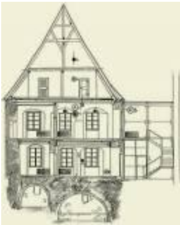
Figure 6: Schematic profile of Hahnemann's House with the modern staircase and lift attached to the right

After the special cultural and historical value of the house became known, in 2002/3 the roof and exterior facade were restored, while measures were taken to reinforce the structure overall. The work was undertaken by the current owner, the city of Torgau, under the direction of Hainz Inc., an architectural firm located in Meissen. Noll-Minor, the Torgau restoration studio, was entrusted with securing and restoring the valuable wall and ceiling paintings, as well as with overseeing all renovation measures (figures 6 and 7).