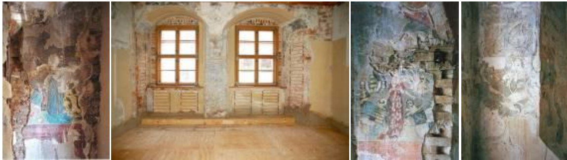
Figure 5: Murals in Hahnemann's House

These proved to be the oldest domestic murals found anywhere in Saxony (figure 5).