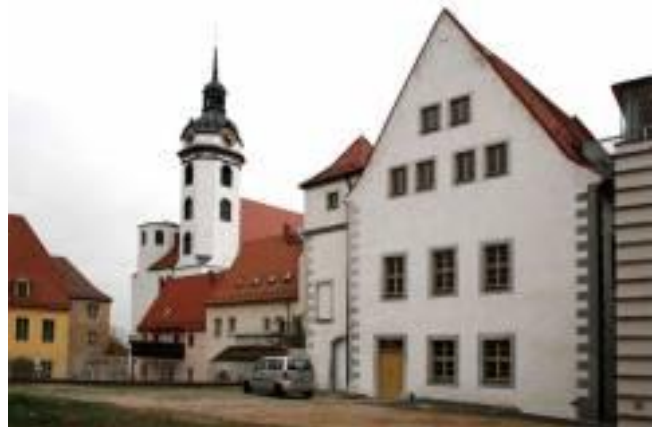
Figure 3: Rearview of Hahnemann's House and the Church of St. Mary's.